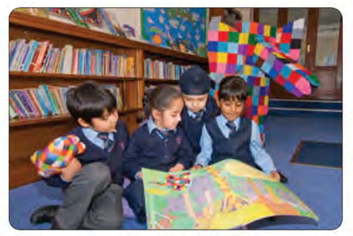
Is this where Elmer the Elephant lives? The Library is where Reception children find out.

There is emphasis on learning the alphabet phonetically, and we teach our children to form their letters correctly. They hear all sorts of stories and talk about them, too.