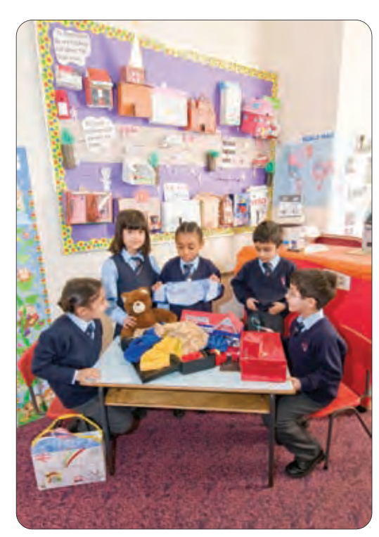
Year 1 pack a case of suitable holiday-wear as Barnaby goes on his travels.

The other subjects help to accustom the children to using the skills they've learnt in English and Maths. They are beginning to take an interest in the wider world and to ask "when" and "where" questions.