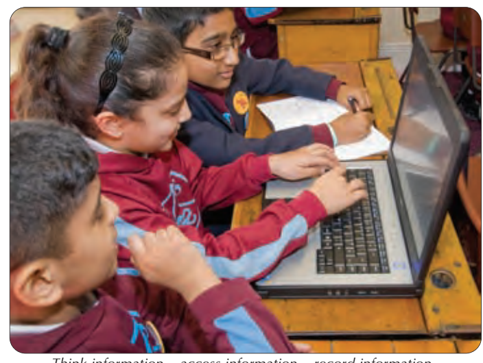
Think information – access information – record information. Year 5 share the ICT work.

Pupils concentrate on the techniques needed for Selection Tests to grammar school and other formal