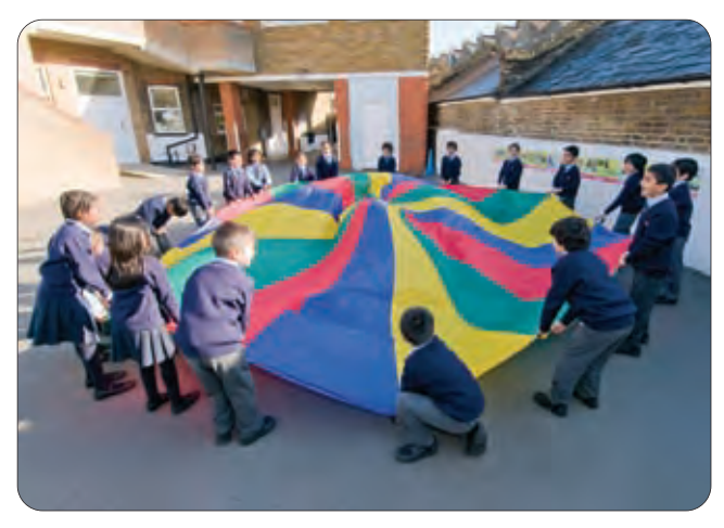
About to launch the parachute. Teamwork is essential if Year 2 are to get it in the air.

The children are guided from daily heard reading to becoming independent readers responsible for choosing their own books from set lists to read at home each night. They keep track of this in their own record book.