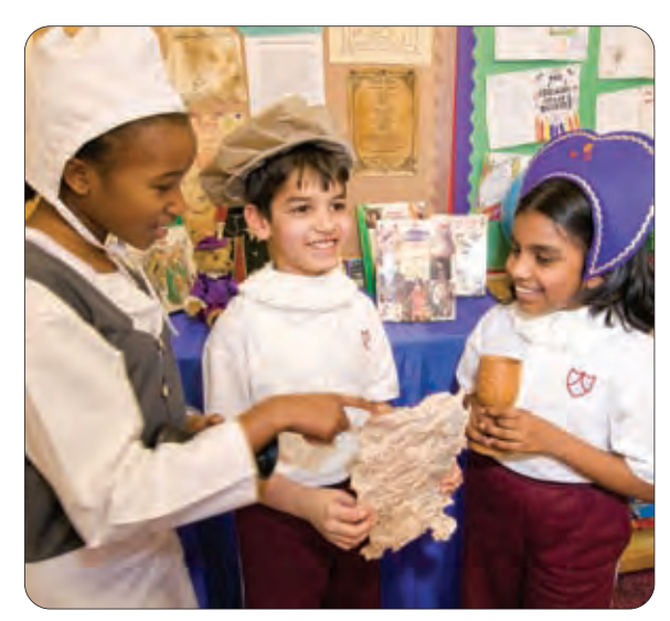
Wealthy Year 4 Tudors discuss their menu with the cook.

English and Maths are becoming more demanding. In English children are taught to write for different types of reader - some write and decorate stories for the Reception Class children. In Maths children learn to acquire and understand data, presenting it in various ways: tables, charts, diagrams.